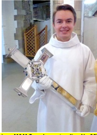
(see M&M Supplement online No 25)

In the meantime I am spending time helping out where I can, singing in the YPC and working for Cuckoobag. I have another possibility of going to the Cameroon to work with a cooperative called LISAP whose MD is a seventh day Adventist