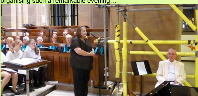
...and after we had all sung verses 5-7 of I will magnify you ...