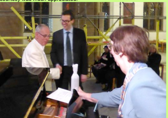
The concert grossed over £1,000 which, after expenses, was donated to three charities: The East Lancashire Hospice, Derian House Children's Hospice, both of which cater for families in great need, and also to the Cathedral Appeal.