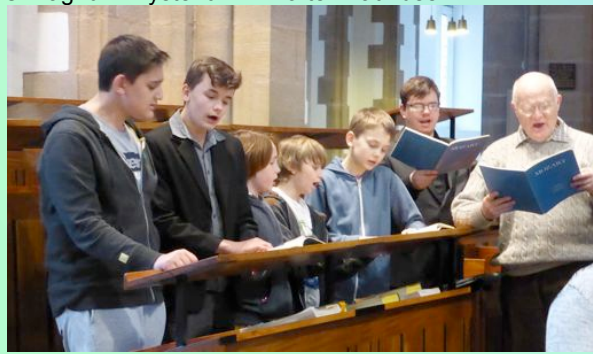
Young singers on Cantoris

20 O magnum mysterium - Morten Lauridsen