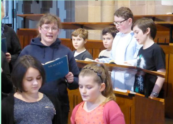
Young singers on Decani